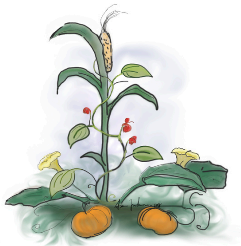
Three Sisters companion planting technique

The long relationship between squash bees and Cucurbita plants is deeply tied to human history in the Americas. Squash is one of the oldest domesticated crops in North America, cultivated for over 10,000 years. Indigenous peoples, including the Haudenosaunee and Aniyvwiya, developed the “Three Sisters” planting system, intercropping squash, corn, and beans to support ecological and nutritional resilience. In these ancestral systems, squash bees were vital to the success of squash harvests, making them part of a rich agroecological heritage.