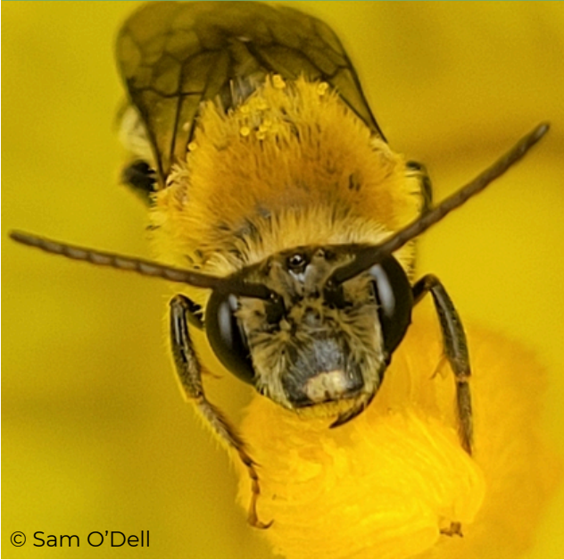
Hoary squash bee, Xenoglossa (Peponapis) pruinosa

Squash bees are solitary bees native to North and South America that specialize in pollinating pumpkins, summer squash, winter squash, zucchini, and gourds (aka Cucurbita ). These bees are expert foragers on squash blossoms and are active early in the morning, often before other pollinators are awake.