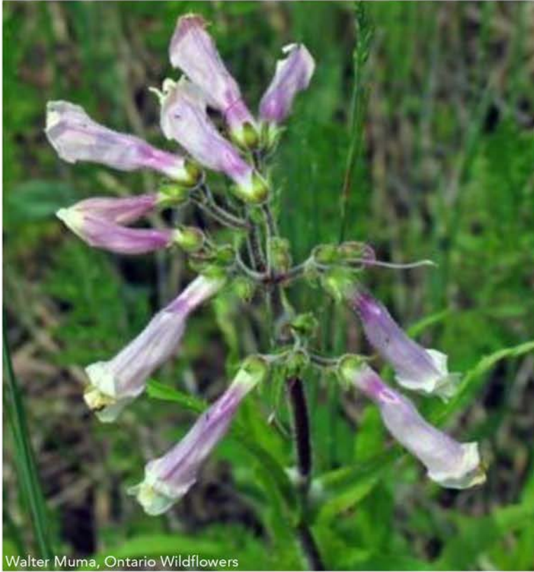
Walter Muma, Ontario Wildflowers