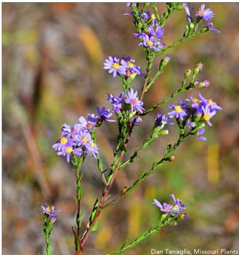
Dan Tenaglia, Missouri Plants

Smooth Aster, Glaucous Aster, Smooth-leaved Aster