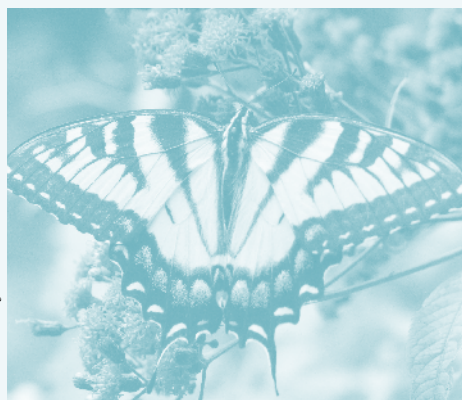
Eastern Tiger Swallowtail.