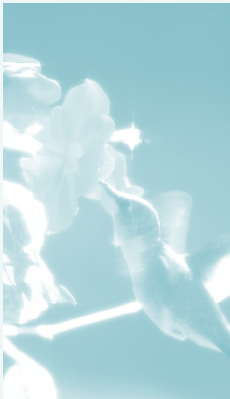
Ruby-throated Hummingbird, a summer species in the Prince Edward Island ecoregion.

Butterflies prefer open and sunny areas such as meadows and along woodland edges that provide bright flowers, water sources, and specific host plants for their caterpillars. Gardeners have been attracting butterflies to their gardens for some time. To encourage butterflies place flowering plants where they have full sun and are protected from the wind. They usually look for flowers that provide a good landing platform. Butterflies need open areas (e.g., bare earth, large stones) where they can bask, and moist soil from which they wick needed minerals. Butterflies eat rotten fruit and even dung, so don't clean up all the messes in your garden! By providing a safe place to eat and nest, gardeners can also support the pollination role that butterflies play in the landscape. There is a large diversity of butterflies on Prince Edward Island and it is common to see the Canadian Tiger Swallowtail ( Papilio canadensis ), the Long Dash Skipper ( Polites mystic ), the Brown Elfin ( Callophrys augustinus ), and the White Admiral ( Limenitis arthemis ).