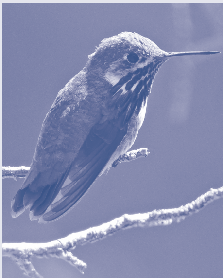
Calliope Hummingbird, a year-round species in the Okanagan Range ecoregion.