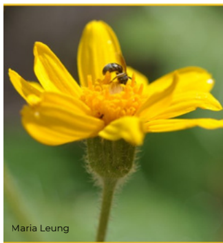
Narrow-leaved Arnica ( Arnica angustifolia )