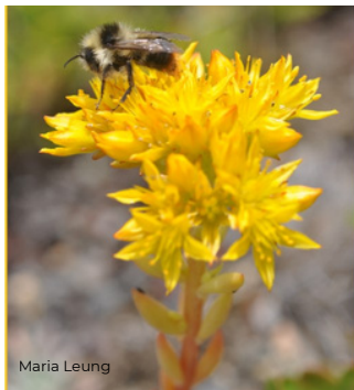
Stonecrops (Genus Sedum )