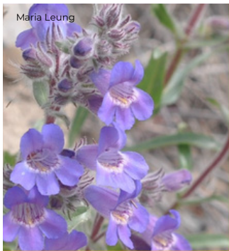
Gorman's Beardtongue ( Penstemon gormanii )