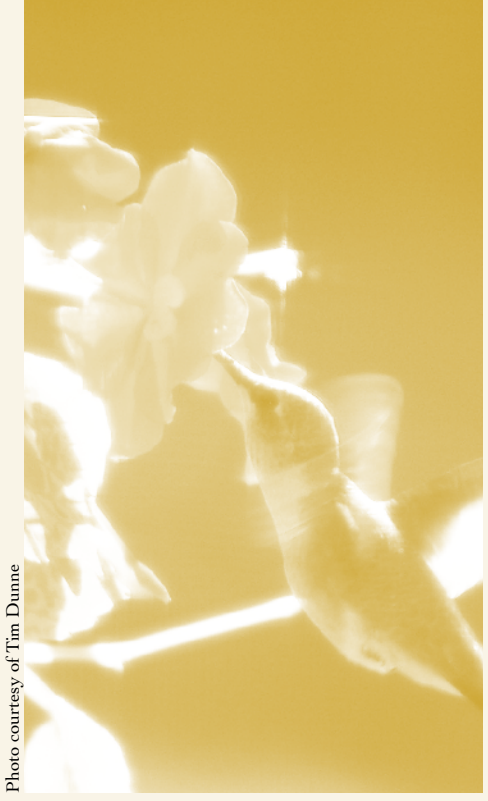
Ruby-throated Hummingbird, a summer species in the Manitoulin-Lake Simcoe ecoregion.