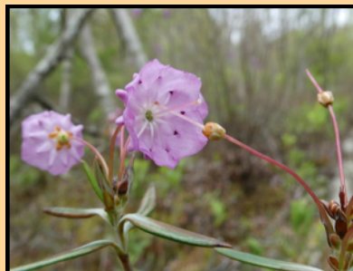
Pale bog laurel ( Kalmia polifolium )