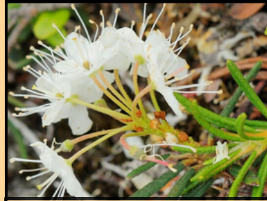
Northern Labrador tea ( Rhododendron tomentosum )