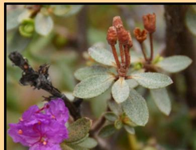
Lapland Rosebay ( Rhododendron lapponicum )