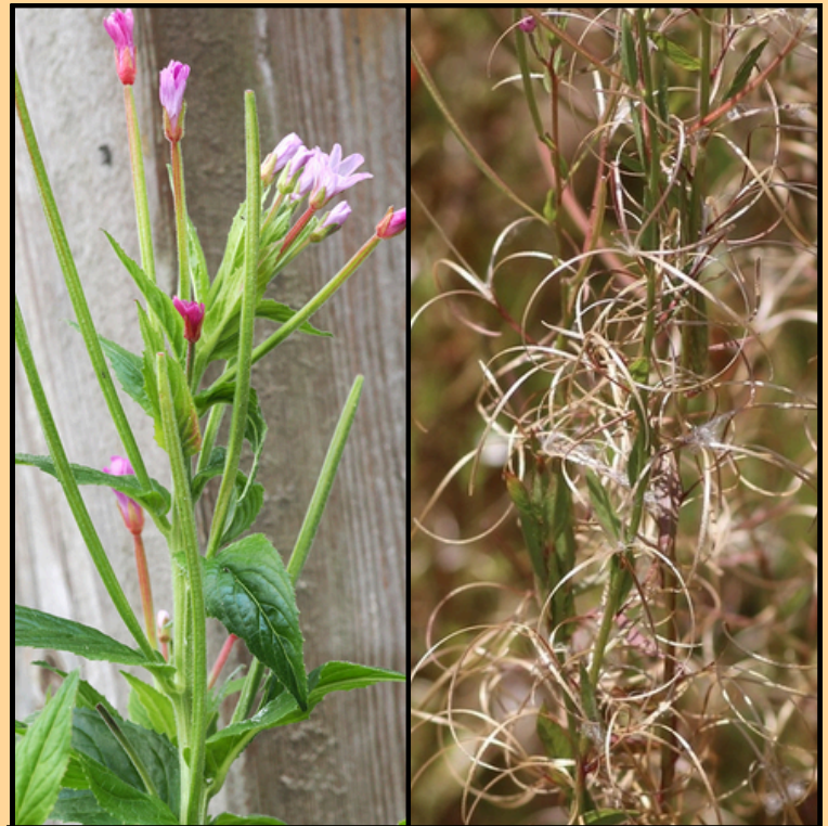
Fringed willow-herb (Epilobium ciliatum)

Willow-herb species ( Epilobium spp. ) have: