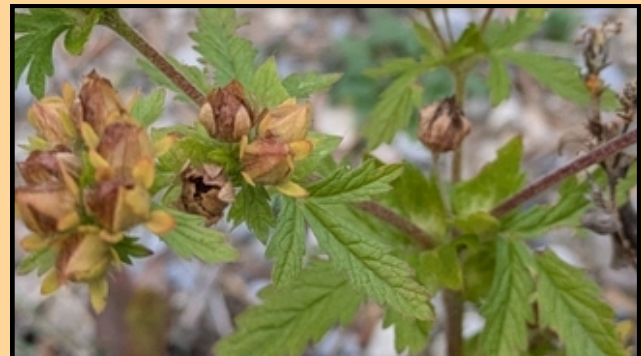
Rough cinquefoil ( Potentilla norvegica )