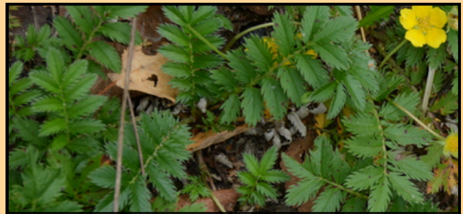
Silverweed ( Argentina anserina )