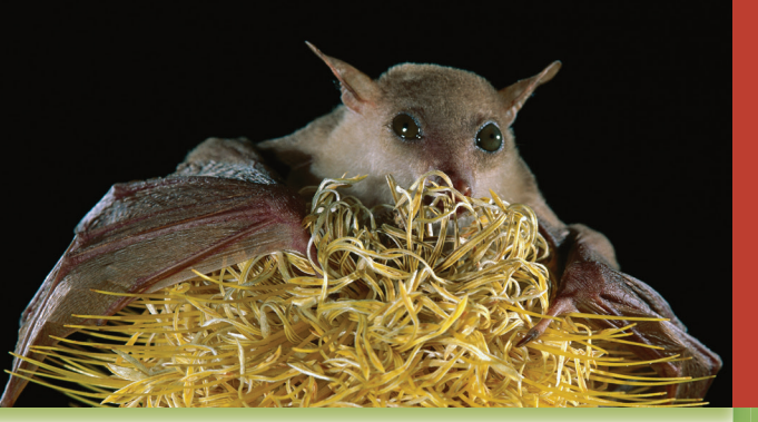
Macroglossus minimus pygmaeus, small long-tongued fruit bat, Northern Blossom Bat, feeding on Banksia sp. flower, North Queensland, Australia. Photo ⊚ Jean-Paul Ferrero/Auscape/Minden Pictures. Bat Conservation International

The diversity of South American bats is as impressive and varied as its landscape. In lowland forests, there are greater numbers of bats and more bat species than in any other part of the world. The range of some of the more "interesting" species overlies roughly with maps of the cultures who attained the highest achievements in the New World before the arrival of Columbus.